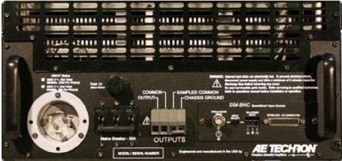
Figure 5.2 7548RLY Back Panel